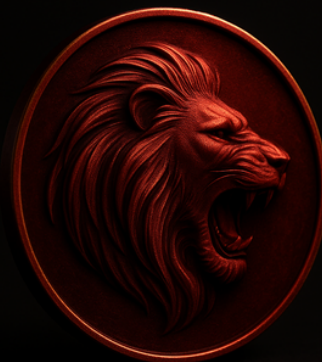
Tier IV- Circle of Legacy