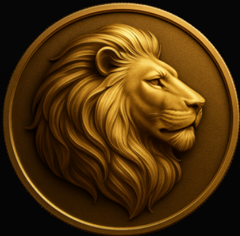
Tier I- Circle of Entry