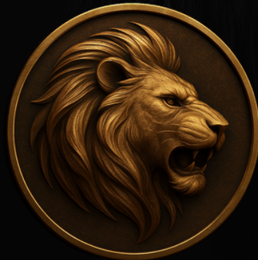
Tier II- Circle of Influence