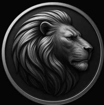
Tier III- Circle of Power